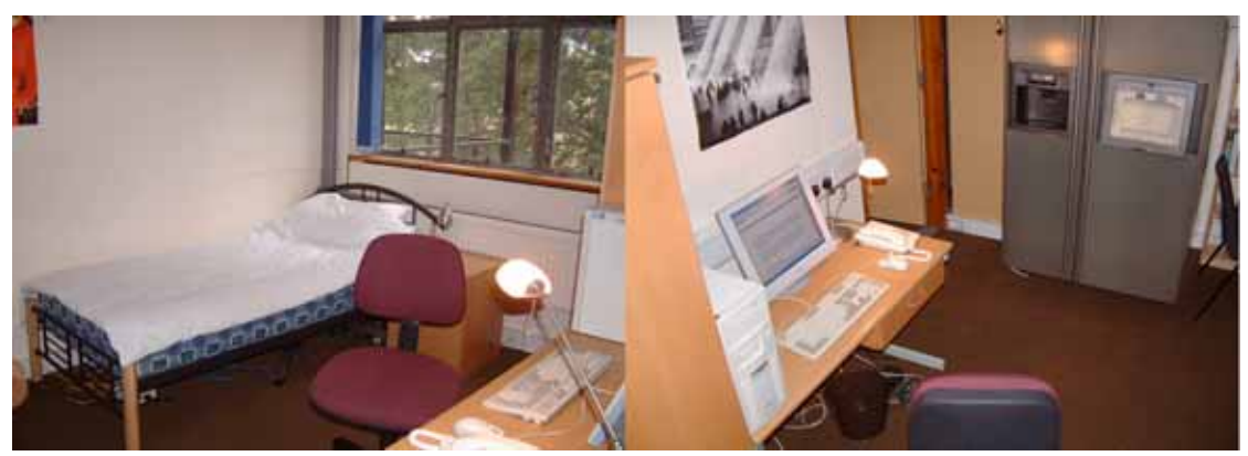
Fig. 1 - The iDorm